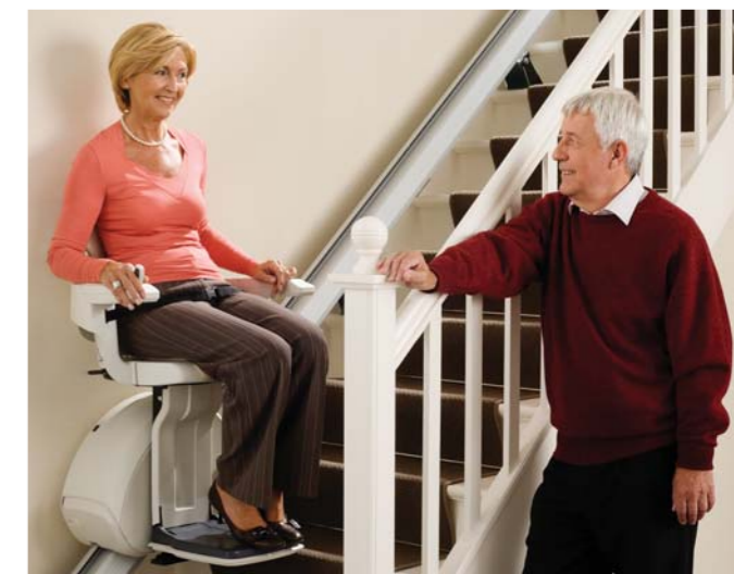
The photos, drawings and other information are simply an indicator and could be modified without any notice.